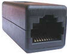
Rear View of E10180R