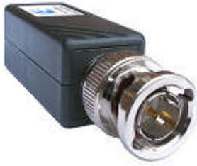
Video Balun BNC Male to RJ45 Slim Part Number: E10180R