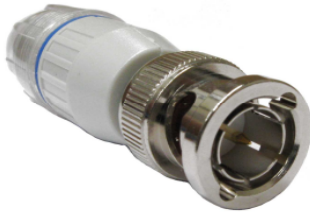
Tubular Easy Connect Video Balun BNC Male to Push Terminal Part Number: E10180V