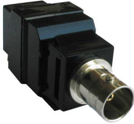
Video Balun BNC Female RJ45 Keystone Part Number: E10185S