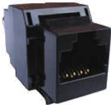
Rear View of E10185S