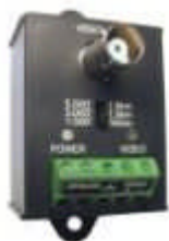
Active Transmitter P/N: E10610T