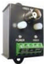
Active Receiver P/N: E10610R