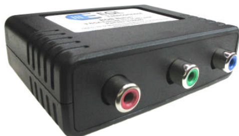
RGB Balun 3 RCA Female to 1 RJ45 Part Number: E10640