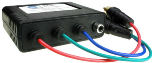
HDTV Balun 4 RCA to 1 RJ45 Part Number: E10645