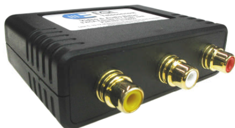
Audio & Video Balun 3 RCA Female to 1 RJ45 Part Number: E10655

This Balun provides a low cost and versatile cabling solution for audio & video distribution, for example, VCR output to TV or Projector.