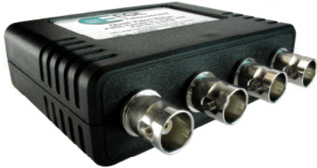
Quad Video Balun BNC Female Part Number: E10172