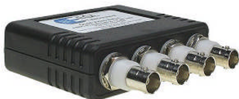
Quad Video Balun BNC Female Bulkhead Panel Mount Part Number: E10172B

Note: An Installation Guide for Video Balun installations is available on request. For optimum results the recommendations provided in the guide must be followed.