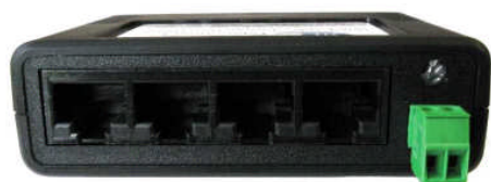
Quad Power Through Video Balun Rear View