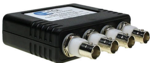
Quad Power Through Video Balun 4 x BNC Female to 4 x RJ45 Jack Part Number: E10174