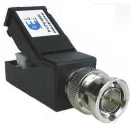
Quick Connect Video Balun BNC Male to IDC Part Number: E10180C