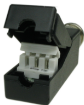
Rear View showing IDC