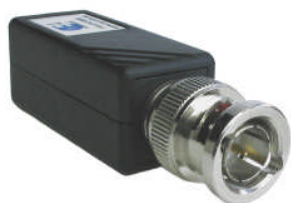
Video Balun BNC Male to RJ45 Slim Part Number: E10180R