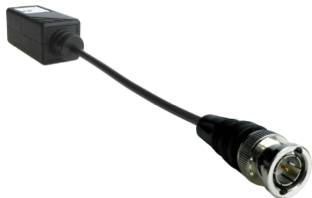
Video Balun BNC Male to RJ45 Part Number: E10180T