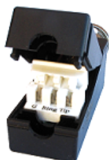
Rear View showing IDC