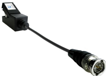
Quick Connect Video Balun BNC Male to IDC Part Number: E10180TC