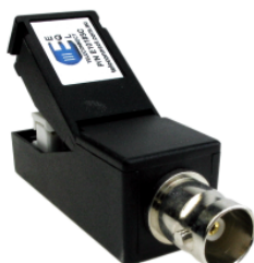
Quick Connect Video Balun BNC Female to IDC Part Number: E10185C