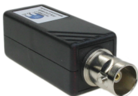
Video Balun BNC Female to RJ45 Slim Part Number: E10185R