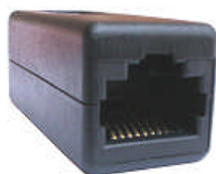
Rear View of E10185R