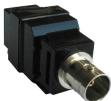
BNC Female RJ45 Keystone Part Number: E10185S