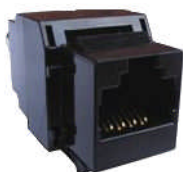
Rear View of E10185S

Use in conjunction with E10185P, to create a professional rack mount solution for cameras requiring a single point to point Cat 5e wiring solution. In this configuration, connections to the DVR will be by using a short BNC Male patch cable connected to the BNC Female coaxial interface.