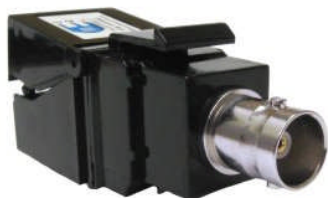
Quick Connect Video Balun BNC Female IDC Keystone Part Number: E10185SC