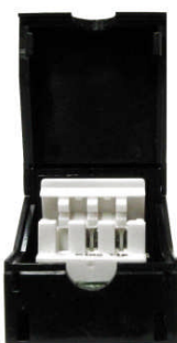
Rear View of E10185SC