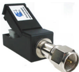
Quick Connect Video Balun F Male to IDC Part Number: E10190C