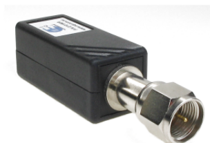
Video Balun F Male to RJ45 Slim Part Number: E10190R