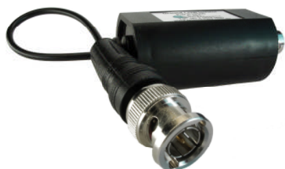
Ground Loop Isolator BNC Male with 100mm Mini Coax to BNC Female Part Number: E10500 (Camera End)