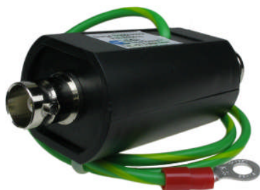
Part Number: E10510F