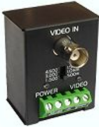
Active Transmitter P/N: E10600T