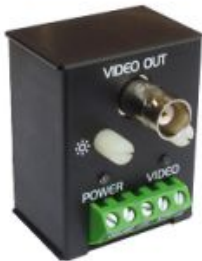
Active Receiver P/N: E10600R