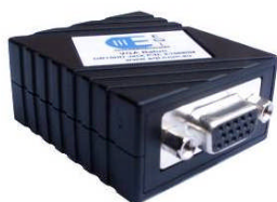
Monitor Balun Part No: E10680M

The VGA Balun has been specifically designed to allow a VGA Monitor to be remotely located from the computer. The VGA Balun comprises a PC Balun and a Monitor Balun. They must be used together as a pair. Shielded Category 5e cable terminated in shielded RJ45 Plug must be used to interconnect the 2 units otherwise there will be picture distortion.