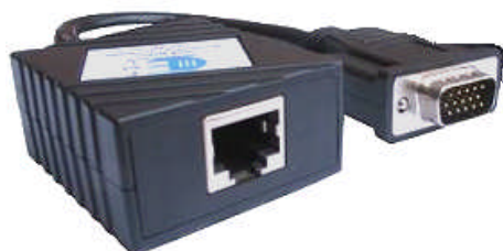
PC Balun Part No: E10680C