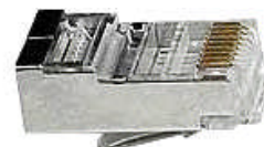
Shielded RJ45 Plug