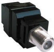
F Female to RJ45 Keystone Case P/N E10980FK