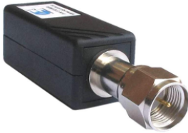
F Male to RJ45 Slim Case P/N E10980MR