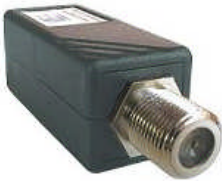
F Female to RJ45 Slim Case P/N E10980FR